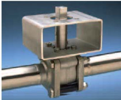
Matching ISO 5211 type bolt and centering pattern in the bracket allow quick installation of actuators. Secondary containment units with ISO 5211 configurations fit between valve pad and bracket assembly.

A precision machined, solid 316/316L stainless steel ball and blow-out proof bottom entry stem design combine to direct unrestricted flow, with maximum operating safety, through a 316L stainless or A105 carbon steel body. Fire-safe design is also available.