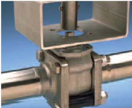
ISO 5211 type bolt pattern and centering lip in the forged 316L stainless or A105 carbon steel center sections ensure alignment of bracket and actuator assembly.