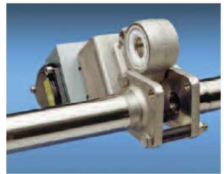
ISO 5211 type centers retain one bolt removal (swing-out design) for in-line maintenance of internal component parts. Larger valves use a similar "lift out" feature.

A precision machined, solid 316/316L stainless steel ball and blow-out proof bottom entry stem design combine to direct unrestricted flow, with maximum operating safety, through a 316L stainless or A105 carbon steel body. Fire-safe design is also available.