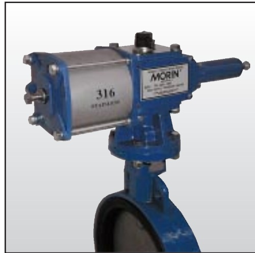
Morin Cast Adaption