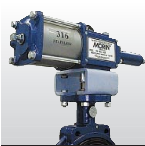
Traditional Formed Mounting Bracket